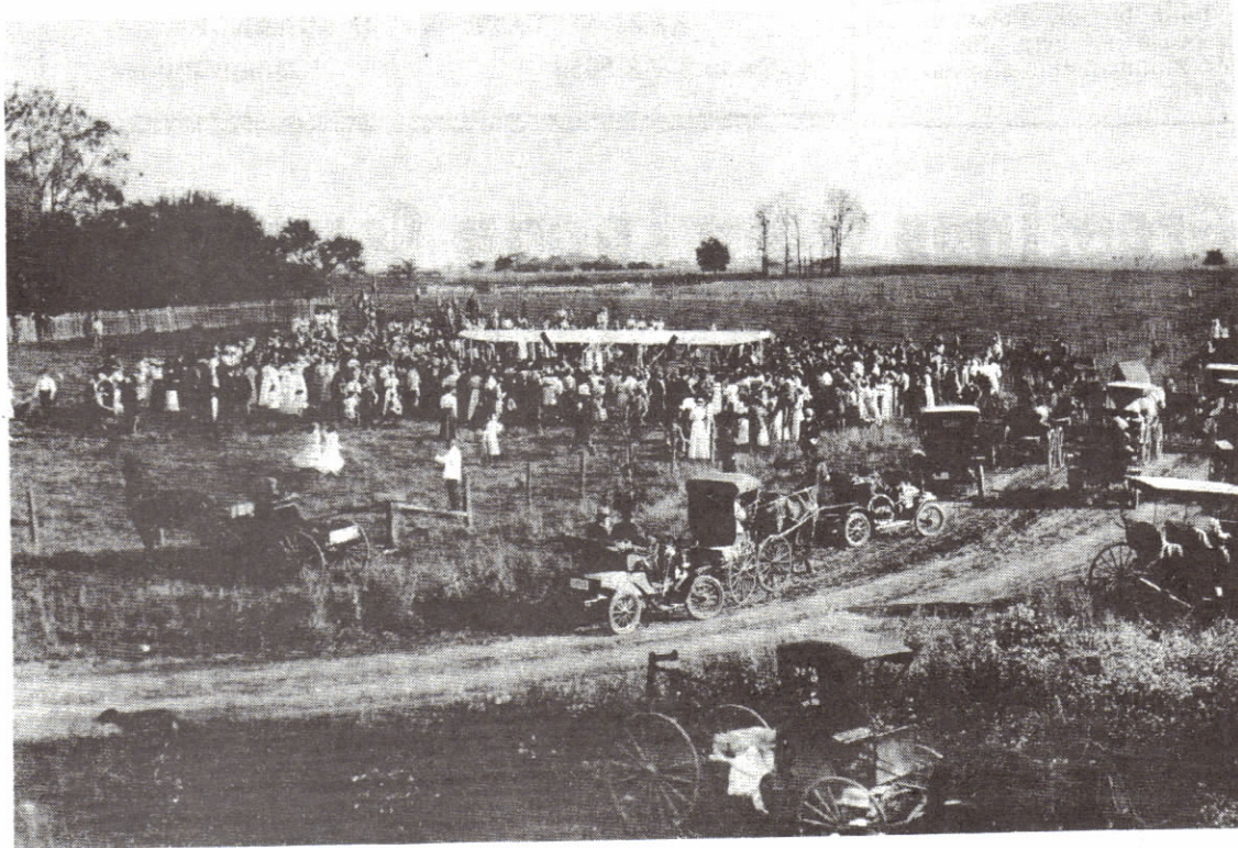
HUNDREDS OF RESIDENTS OF THIS AREA gathered at the scene of the landing of the famous Brookins-Wright airplane in Obermiller Heights in the south part of Mount Pulaski, to see this unbelievable episode in the new method of transportation.

Chicago to Springfield on Sept. 29, 1910. The plane landed in Mount Pulaski for refueling and many of today's residents well remember the event and the excitement.