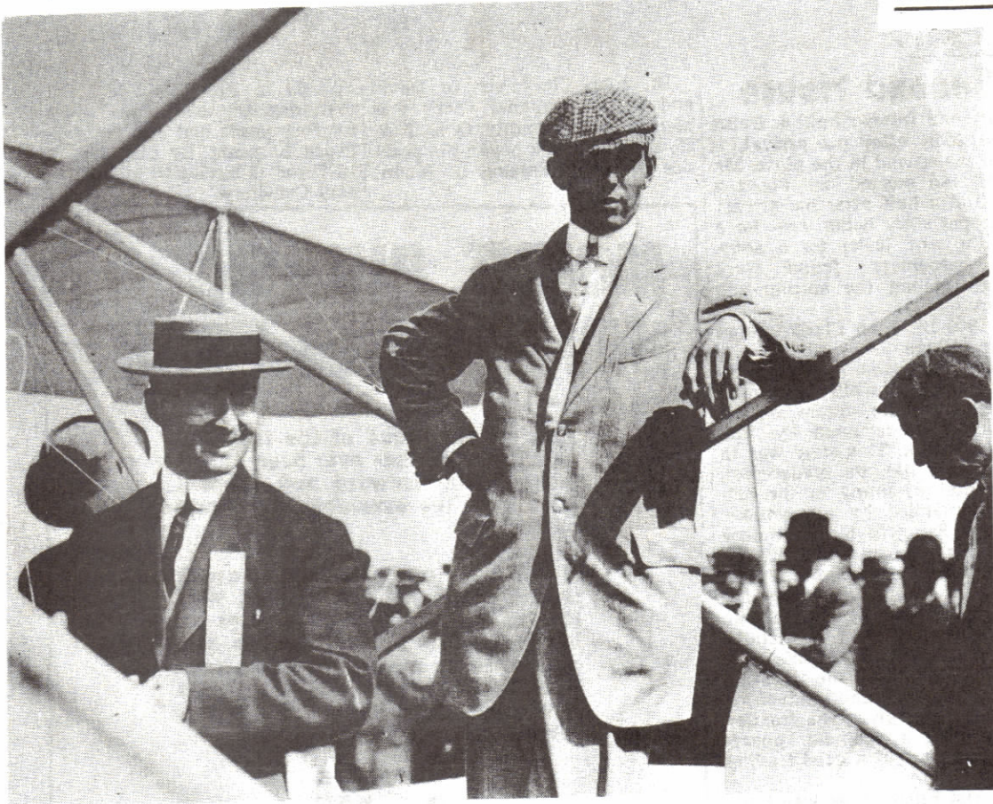
TWO HISTORIC FIGURES shown above are Wilbur Wright (left) and Walter Brookins (right) as participants in the record-breaking and history-making flight of the Wright Bros. ariplane from

Chicago to Springfield on Sept. 29, 1910. The plane landed in Mount Pulaski for refueling and many of today's residents well remember the event and the excitement.