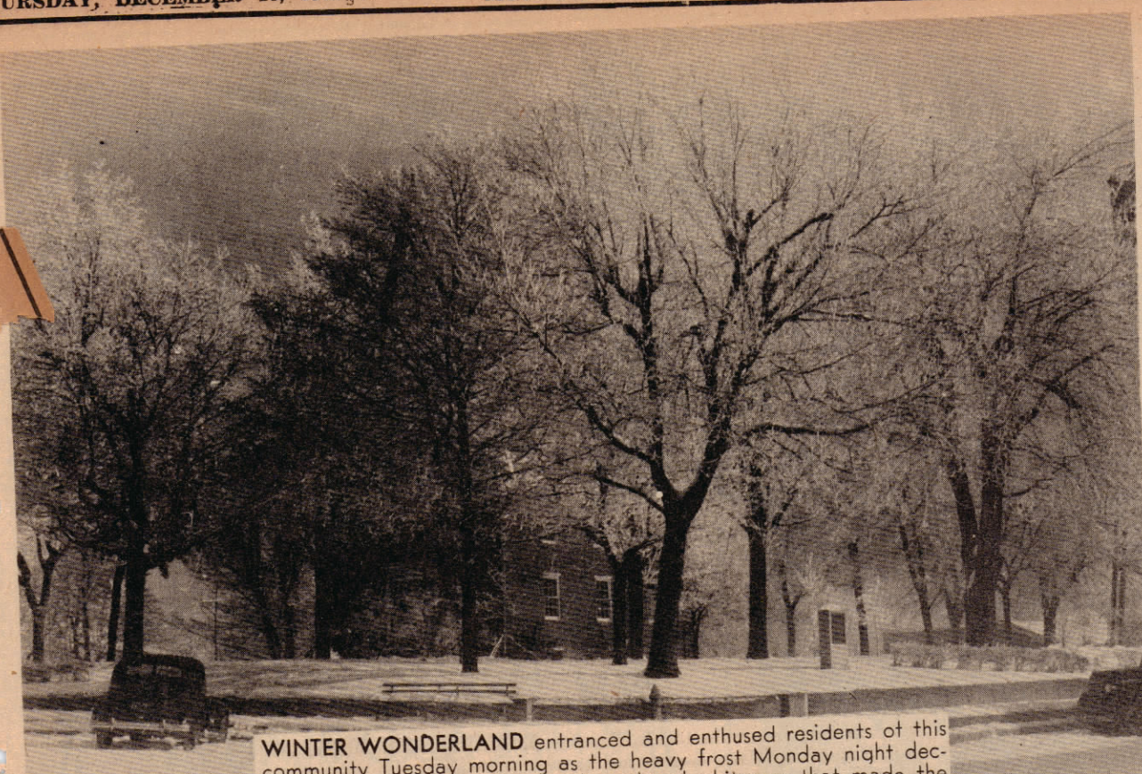
WINTER WONDERLAND entranced and enthused residents of this community Tuesday morning as the heavy frost Monday night decorated trees and shrubbery with a glazed whiteness that made the surroundings look like wonderland for sure. (Times-News Photo)