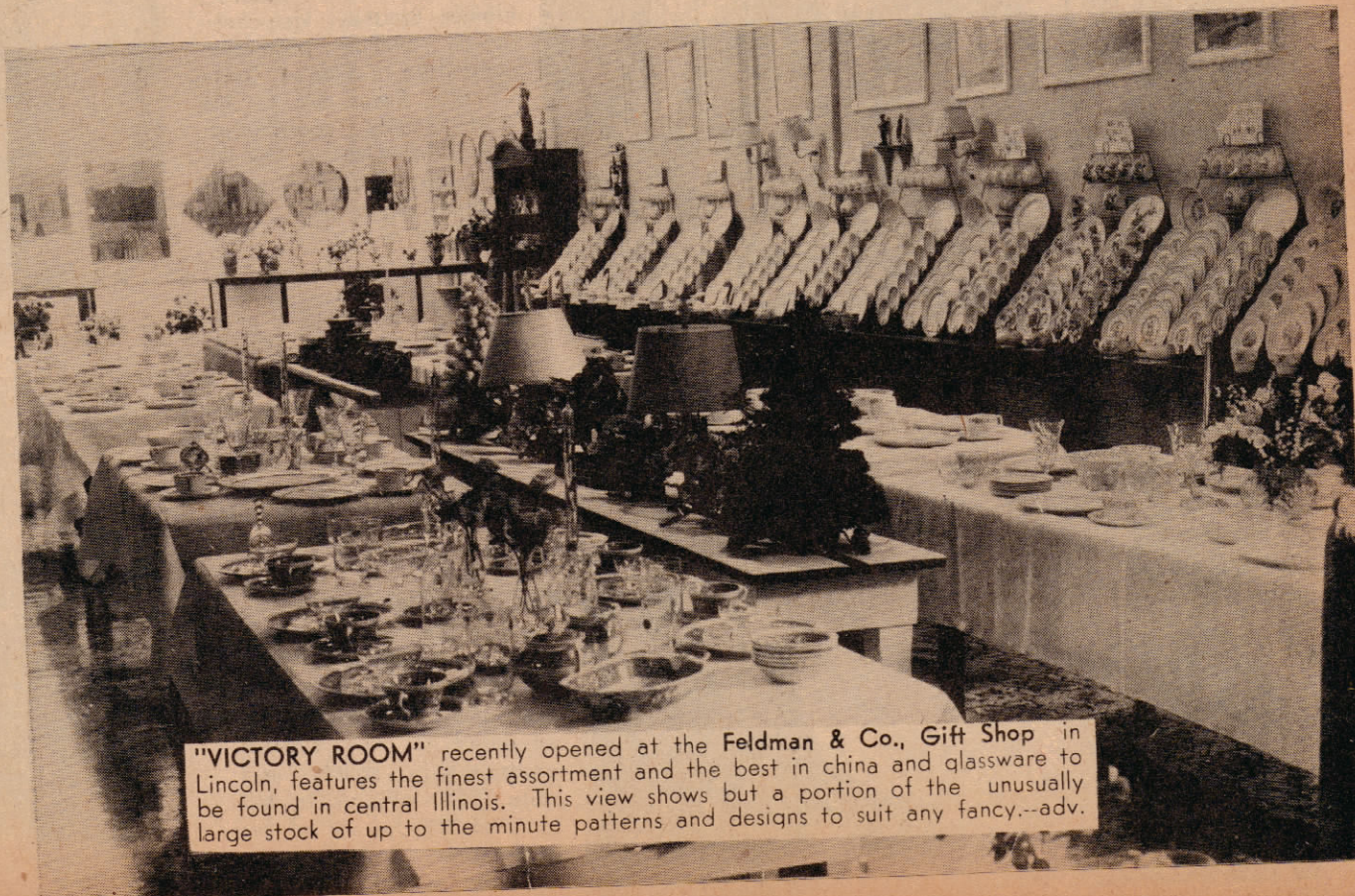
"VICTORY ROOM" recently opened at the Feldman & Co., Gift Shop in Lincoln, features the finest assortment and the best in china and glassware to be found in central Illinois. This view shows but a portion of the unusually large stock of up to the minute patterns and designs to suit any fancy.—adv.