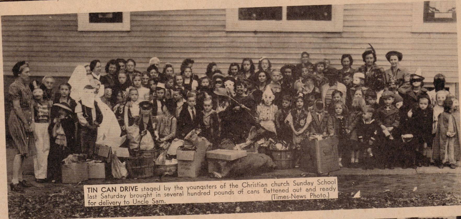
TIN CAN DRIVE staged by the youngsters of the Christian church Sunday School last Saturday brought in several hundred pounds of cans flattened out and ready for delivery to Uncle Sam.