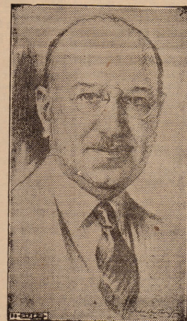
Judge Henry Horner

Nation-Wide Farm Relief. A Democratic State government through a Democratic administration at Washington will make the voice of Illinois' farmers heard throughout the land in compelling a solution of the farmers' problems and in the halting of the disastrous farm board's policies.