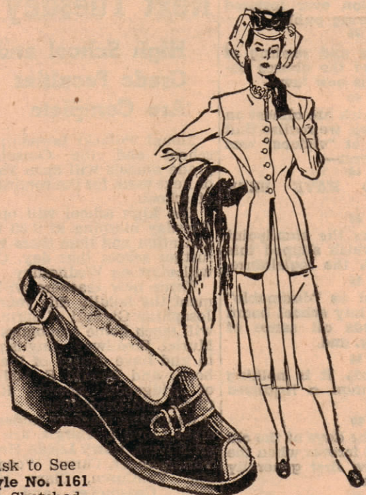
Ask to See Style No. 1161 As Sketched